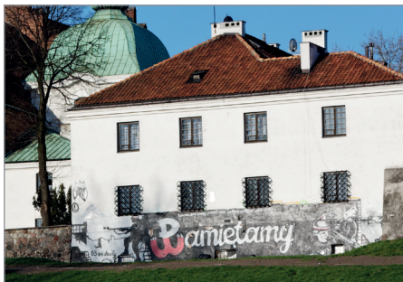
Mural. Church of the Visitation of the Virgin Mary at the New Town.

Murals – contemporary artists pay tribute to the Insurgents also by means of modern art. Thus, it is worth visiting the Rose Garden in the Museum of Warsaw Uprising. It exhibits the works of Wilhelm Sasnal, Henryk Chmielewski better known as Papić Chmiel and others. Further works were painted on a wall of the presbytery of the Church of the Visitation of the Most Blessed Virgin Mary in New Town, wall of the 'Polonia' sport club stadium at Konkwitorska Street and in other locations.