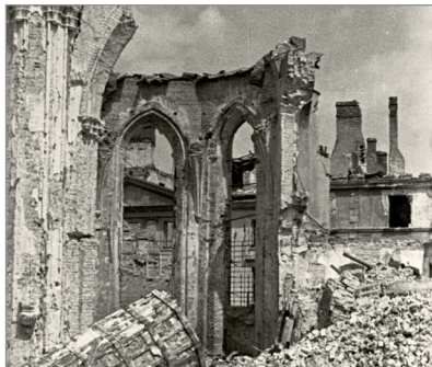
Ruins of St. John Cathedral – remains of chancel. View from Świętojańska Street. In the background tenement of houses at Kanonia Street.

Cathedral Basilica of Martydrom of St. John the Baptist (Bazylika Archikatedralna pw. św. Jana Chrzciciela) ul. Świętojańska 8 – fierce fights for the cathedral took place August 21-27. A bomb raid and a mass attack of the German infantry completely destroyed the church. It is said that a fragment of a caterpillar track from the so-called 'goliath' (light, caterpillar explosive carrier) was embedded in the Cathedral wall from the side of Dziekonia Street. However, it is not true. Most probably, the track is a part of the tank-trap that exploded at 1 Kilińskiego Street.