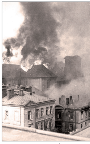
Warsaw Uprising. North Śródmieście district. Roof top view at the Holy Cross Basilica in flames. (Warsaw Rising Museum, photo: Joachim Joachimczyk)

King Sigismund III Vasa Kolumn (Kolumna Zygmunta III Wazy) plac Zamkowy – the oldest and the highest secular monument raised in 1644 from the initiative of Władysław IV in honour of his father, Sigismund III Vasa, who transferred the capital of Poland from Cracow to Warsaw. Three hundred years later, the monument was destroyed into pieces during the German attack on the Old Town. The first trunk of the column from the 17th century and the one destroyed during the Uprising are located now next to the Royal Castle.