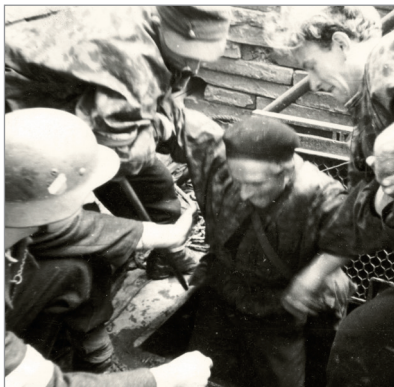
Insurgent from the Old Town leaving of the city sewers at Nowy Świat Street corner of Warecka Street.