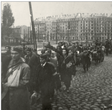
Units of Insurgents going into captivity. Grójecka Street.

September 2 – in the night of September 1, tank shells destroy King Sigismund's Column. The Old Town is seized by the Nazis. The fight in other Warsaw districts continues.