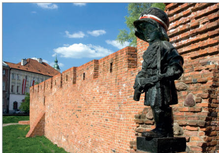
Little Insurgent Monument.