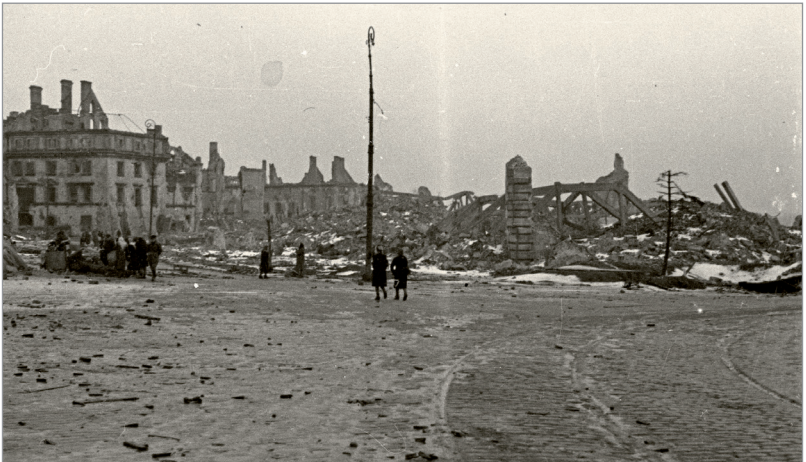
View of Zamkowy Square, from Krakowskie Przedmieście Street. The ruins of the Royal Castle on the right, on the left destroyed house on Świętojańska Street.

The Polish capital city was devastated in nearly 85% and its residents were taken to transition and POW's camps.