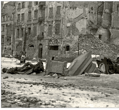
Shattered column and statue of King Sigismund's lying on the pavement at Zamkowy Square. In the background – destroyed houses of western frontage of the square.