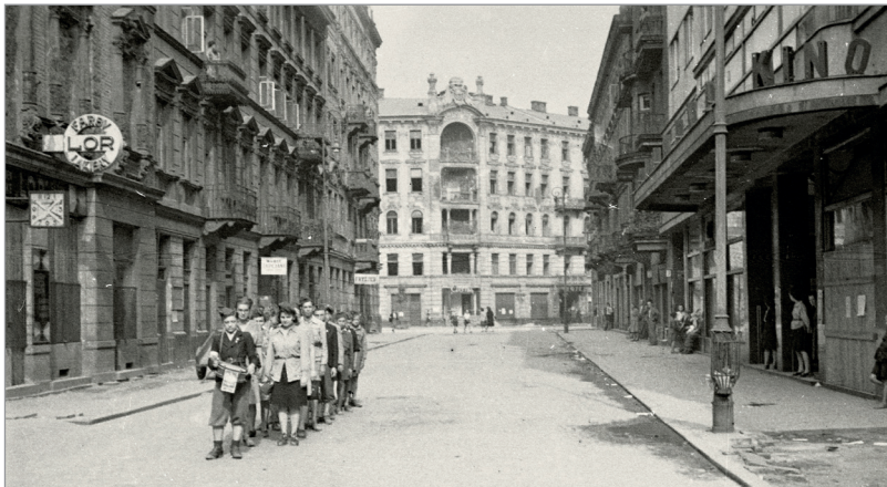
Scouts at Złota Street. In the background, buildings at Zgoda Street. Entry to the 'Palladium' cinema on the right side.

Palladium ul. Złota 7/9 – opened in 1937, the cinema survived the war and served its functions until 2000. During the occupation, the Germans changed its name to 'Helgoland'. Having seized the building, the Insurgents played their chronicles called 'Warsaw is Fighting'. Today, it is a music club and a theatre.