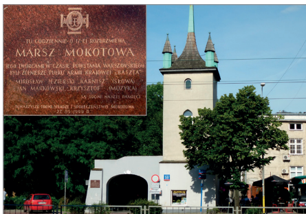
The clock tower of a Gothic house at 59 Puławska Street.