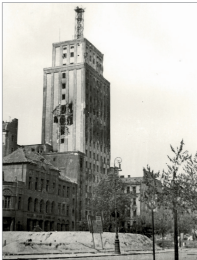
'Prudential' building at 9 Napoleona Square.