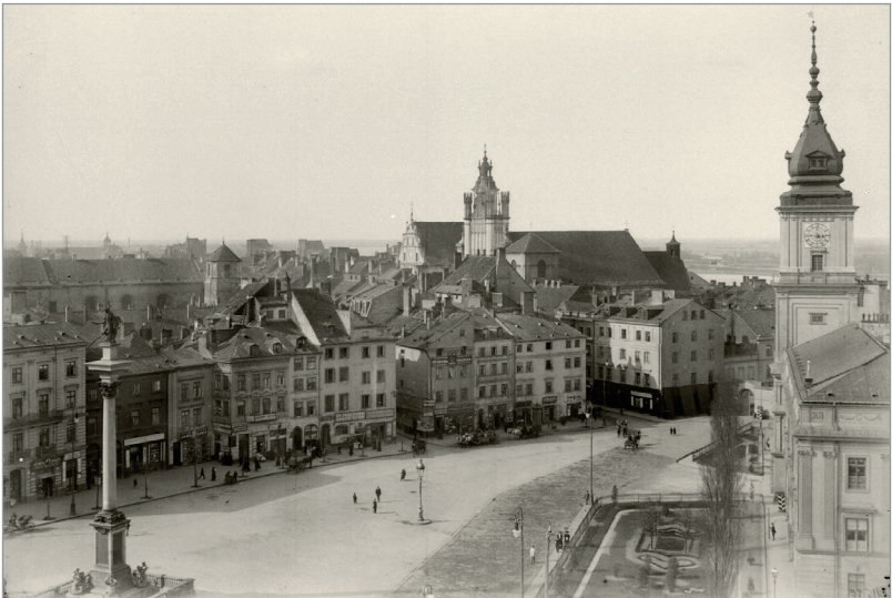
Zamkowy Square

The looming destiny of Warsaw, known as the 'Paris of the East' before the war, was fulfilled by Heinrich Himmler's order saying: 'Every citizen is to be killed. No prisoners are to be taken. Warsaw has to be razed to the ground. Let it be a horrifying example for the whole Europe.'