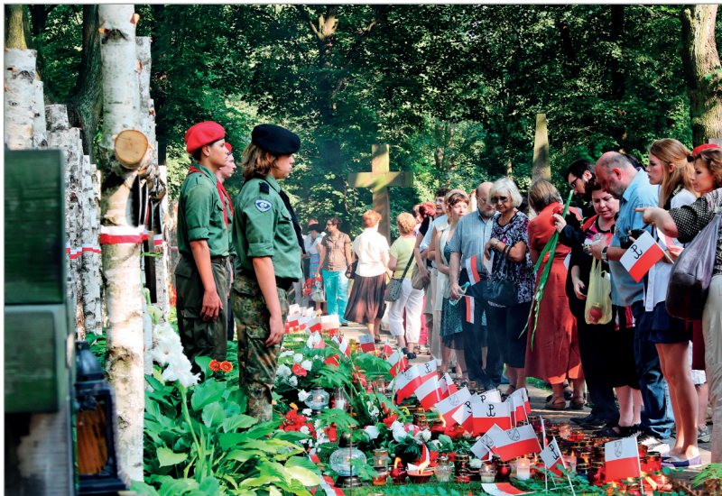
Powązki Military Cemetery. Celebrations of August 1.

August 1 – every year Warsaw pays tribute to the Insurgents. At 5:00 PM the sirens are sounded and for one minute the whole traffic freezes. The national flags are hung on the street of Warsaw and candles are lit in places sacred with the blood of the murdered residents of the city. In the Powązki Military Cemetery, under the Gloria Victis (Latin for “Glory to the Defeated”) monument, the representatives of the highest state authorities, combatants and residents of the capital lay flowers. In the evening on Piłsudskiego Square, the residents of Warsaw sing insurgent songs.