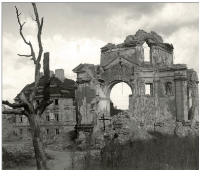
The ruins of Warsaw, 1945. New Town Market Square. Ruins of the Church of St. Casimir.