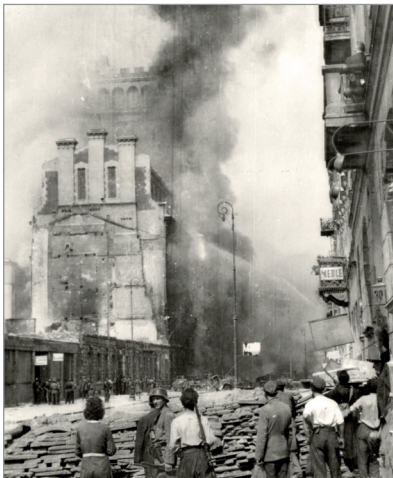
Burning building of Polish Telephone Joint-Stock Company at 37/39 Zielna Street.