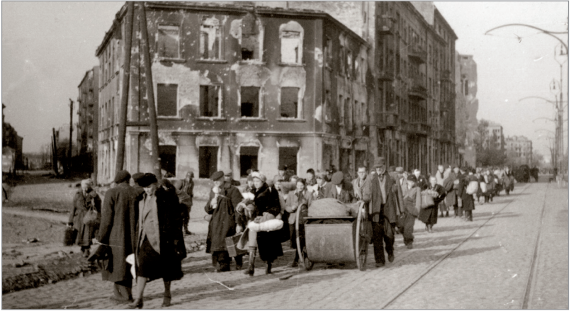
Grójecka Street. Capitulation. The civilians leave the city

The Polish capital city was devastated in nearly 85% and its residents were taken to transition and POW's camps.